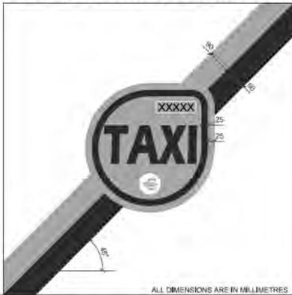
TAXI VEHICLE BRANDING - RIGHT SIDE FRONT DOOR