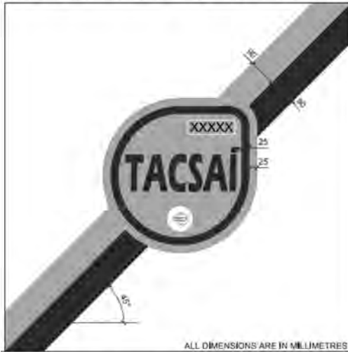
TAXI VEHICLE BRANDING - RIGHT SIDE FRONT DOOR