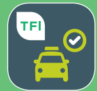
Driver Check App

The Authority maintains an electronic database of links between each licensed SPSV and its current licensed driver. It is the driver's legal responsibility to ensure that this information is constantly up to date. The driver does this by informing the Authority whenever they start driving a different vehicle. This information feeds to the Driver Check App used by the public to ensure that the vehicle and driver they intend to use are licensed and registered with the Authority.