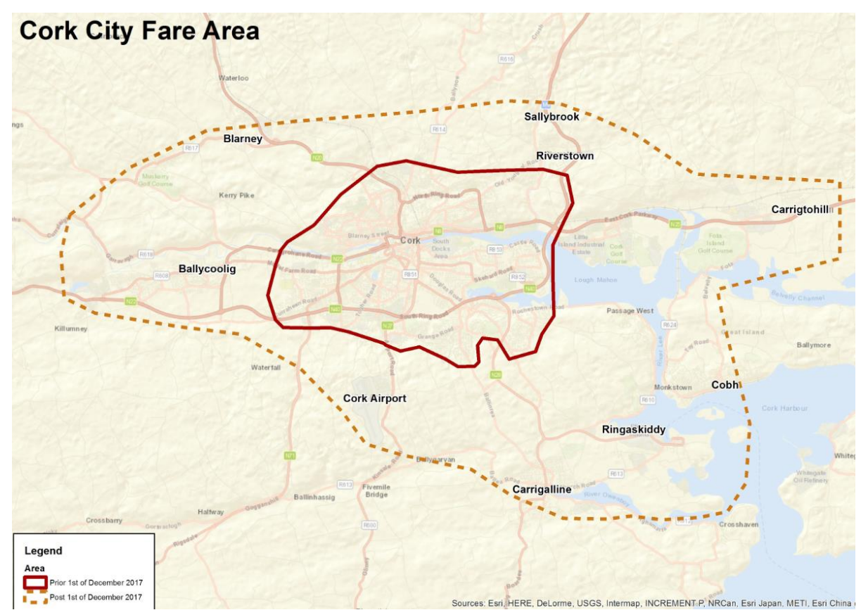
Figure 1: Revised Bus Éireann city fare zone in Cork

A similar analysis in the Limerick city area indicated that there were a number of settlements mostly to the north east of the city fare zone which should be included based on population density, job density and commuting patterns. The new areas included in the Bus Éireann Limerick city fare zone include Castleconnell, Clonlara and Ardnacrusha.