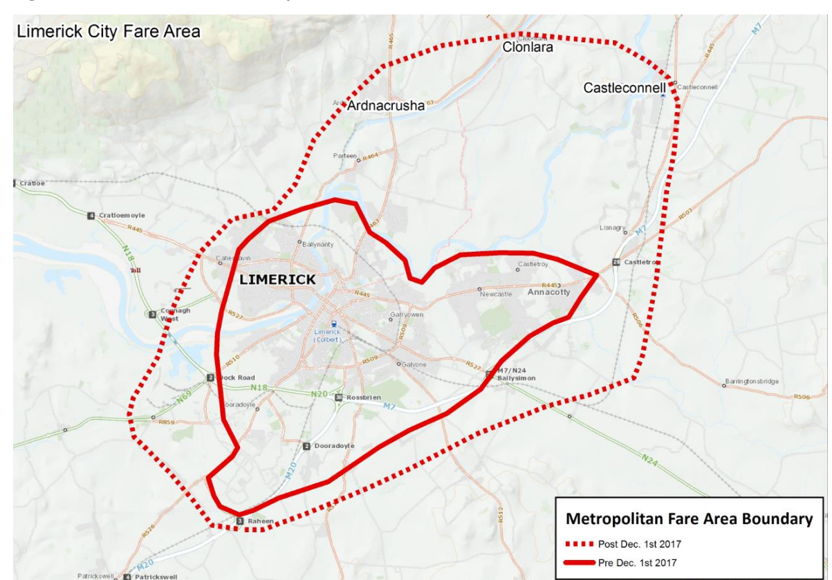
Figure 2: Revised Bus Éireann city fare zone in Limerick

The analysis in the Galway indicated that the city fare zone should be extended both to the east and the west to include Oranmore and Barna, see Figure 3.