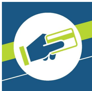
Figure 1 Official credit/debit card sign (blue Pantone 534, green Pantone 382)