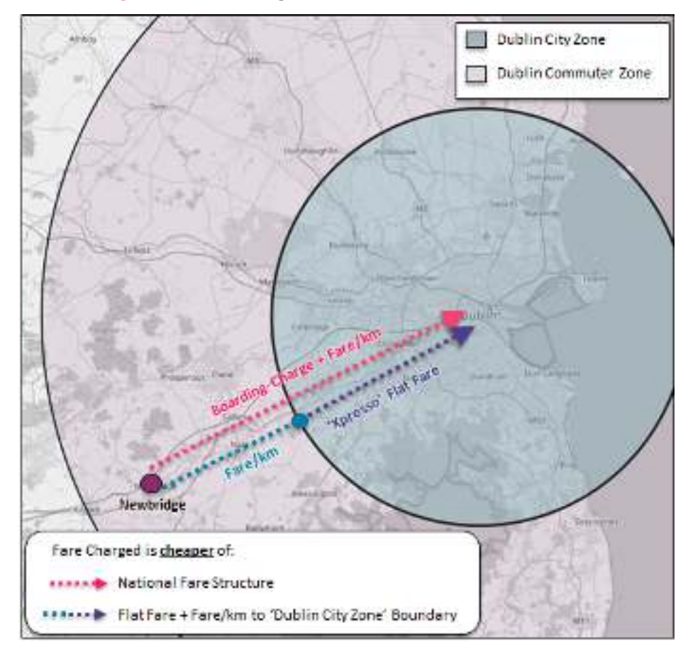
Figure 3. Newbridge to O'Connell St. Fare Example