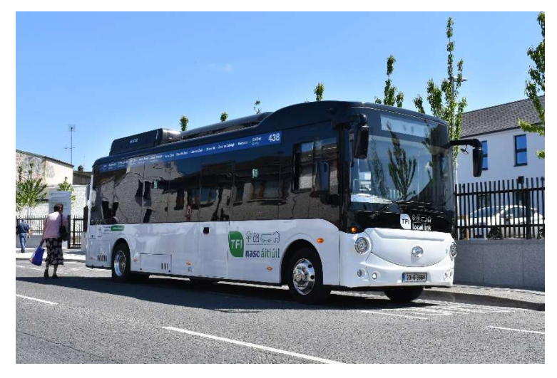
Figure 1 shows fully accessible electric vehicle for TFI Local Link Galway Route 438

The NTA is continually supporting initiatives in the area of climate action including the ongoing transition of the public transport fleet to zero emissions vehicles. Connecting Ireland contributed to this by introducing three fully accessible electric vehicles in Galway (Figure 1), Cavan and Mayo last year.