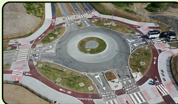
Ireland's first Dutch Roundabout in Dublin

Bike lanes and pedestrian crossings at each junction