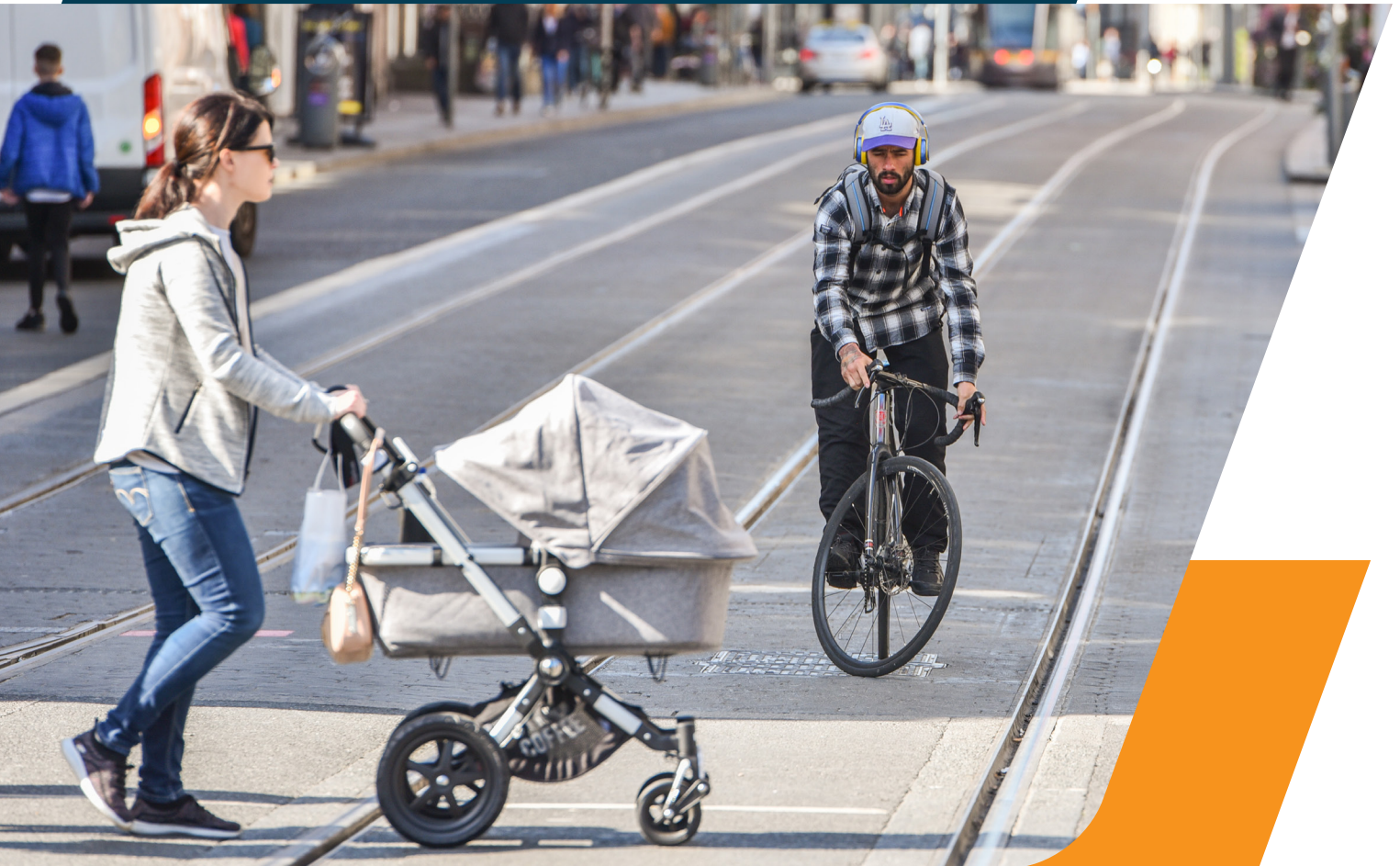
Figure 4: Woman pushing a buggy

Ethnicity: people from ethnic minority groups may be more likely to experience hate crime and harassment. Therefore if appropriate, ethnicity could be considered when examining whether the proposed infrastructure is designed with equity in mind.