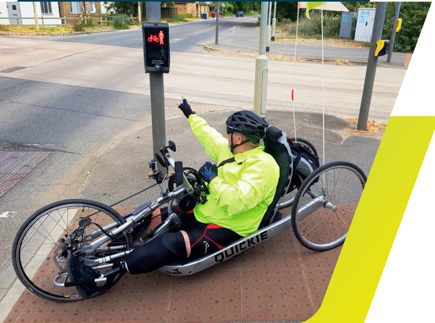
Figure 2: Push Button Design

It is important to note that it is not possible for every single street or road to meet all users' requirements, however this guidance requires that the needs of all users are considered, and where appropriate, that these needs are met. Recommendations arising from the use of this guidance should make allowance for the fact that strategic decisions on route choice and junction type reflect a balance of factors, including safety.