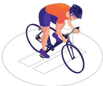
Figure 1: School children cycling

In the absence of any doubt as to whether a characteristic is affected, the screening document in Appendix A can be used for further assessment. The screening questions will be used to determine whether any of the protected characteristics are likely to experience differential and/or disproportionate effects as a result of the proposed scheme. Any characteristics that are perceived to be impacted by the proposed scheme should be further investigated.