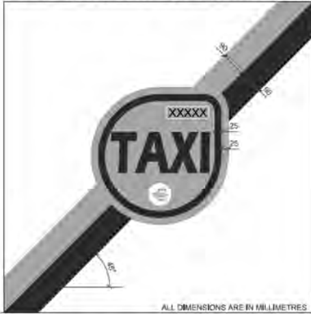
TAXI VEHICLE BRANDING - RIGHT SIDE FRONT DOOR